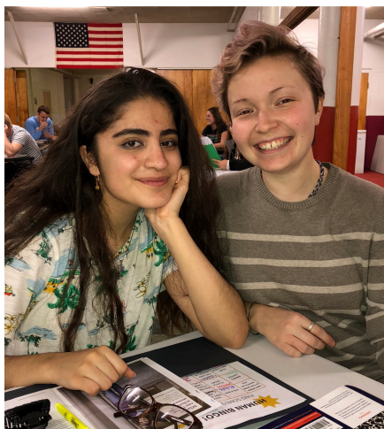
▲ Tutoring last year, in person