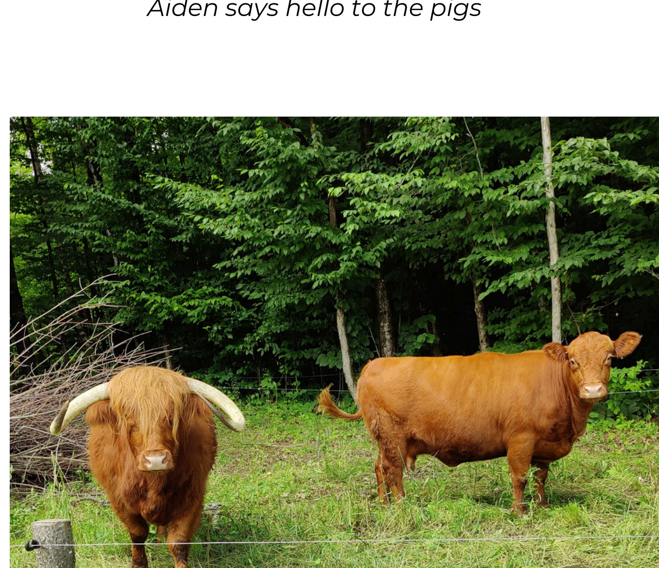
The cow and bull in their pasture